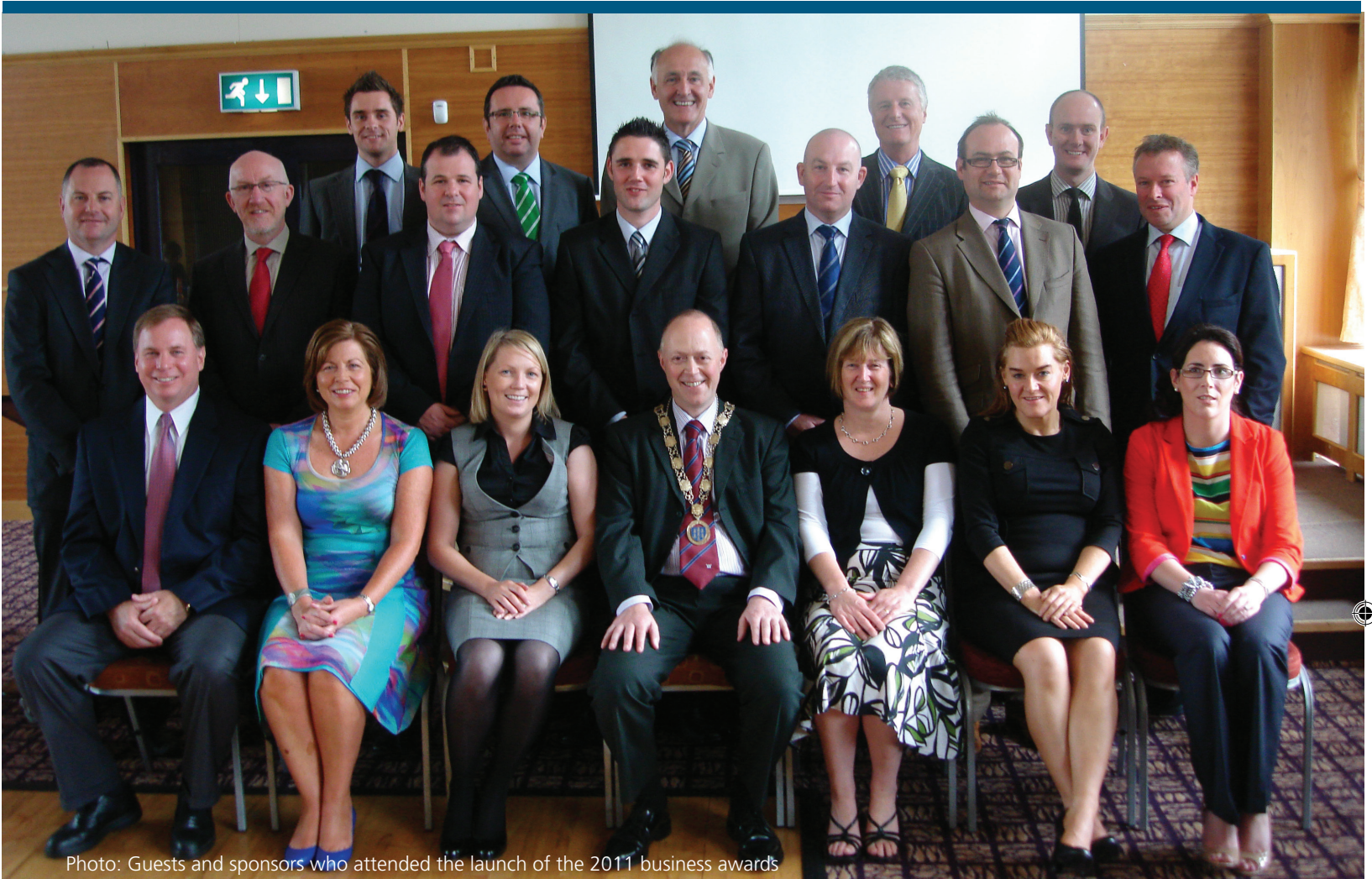
Photo: Guests and sponsors who attended the launch of the 2011 business awards

Borough Chamber of Commerce and Industry