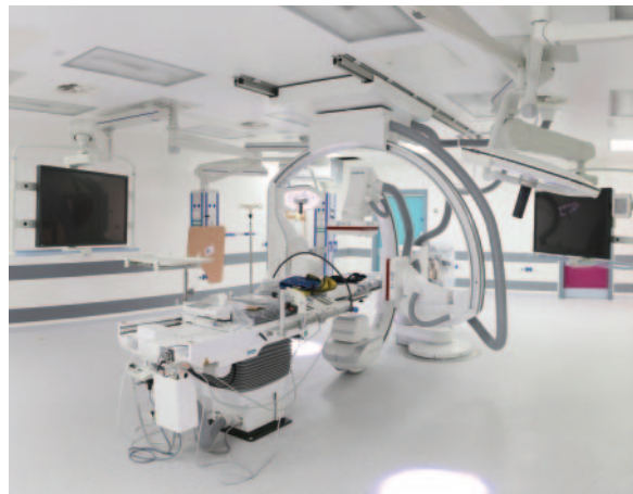
Ballymena Business Centre Tenant: MET Healthcare

"On behalf of Ballymena Business Centre I would like to thank our Business Advisors who through the use of virtual technology continued to provide vital advice and guidance to start ups and existing businesses during lockdown and at the same time managing the ever increasing demands of family commitments; thank you to our crafters in Midtown Makers Shop who used their creative skills to make personal protective masks and scrubs for our frontline workers and thank you to all our business tenants in Galgorm, Ballee and Ballykeel business centres who provided essential services and supplies