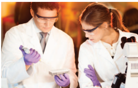
Ballymena Business Centre Tenant: AMS UK

"The outbreak of Coronavirus has been first and foremost a real human tragedy that goes far beyond our understanding. Life has changed and so too will be the way we do business. Many businesses from start-ups to established, sole traders to multi nationals have been greatly impacted, yet through these difficult times we continue to see the birth of new business start-ups as they embark upon their enterprise journey for the first time and observe the outstanding efforts of existing businesses who have gone the extra mile to support our front line workers and the most vulnerable in our community."